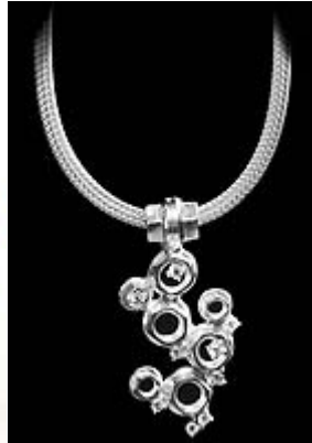
Bijoux racing collection